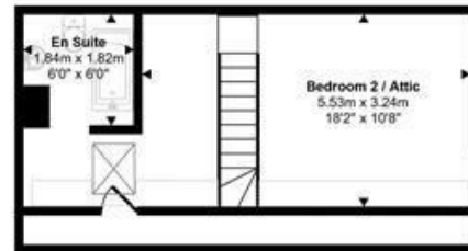
Second Floor Approx 29 sq m / 313 sq ft