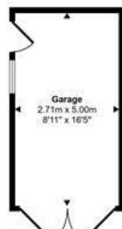
Garage Approx 14 sq m / 146 sq ft

Denotes head height below 1.5m This floorplan is only for illustrative purposes and is not to scale. Measurements of rooms, doors, windows, and any items are approximate and no responsibility is taken for any error, omission or mis-statement. Icons of items such as bathroom suites are representations only and may not look like the real items. Made with Made Snappy 360.