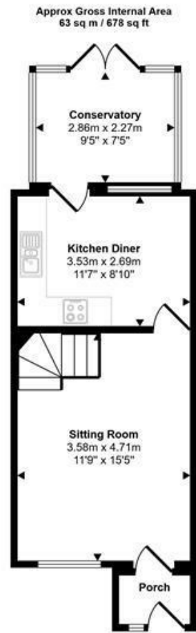
Ground Floor Approx 36 sq m / 390 sq ft