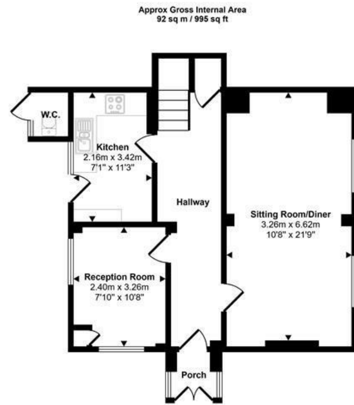
Ground Floor Approx 53 sq m / 570 sq ft