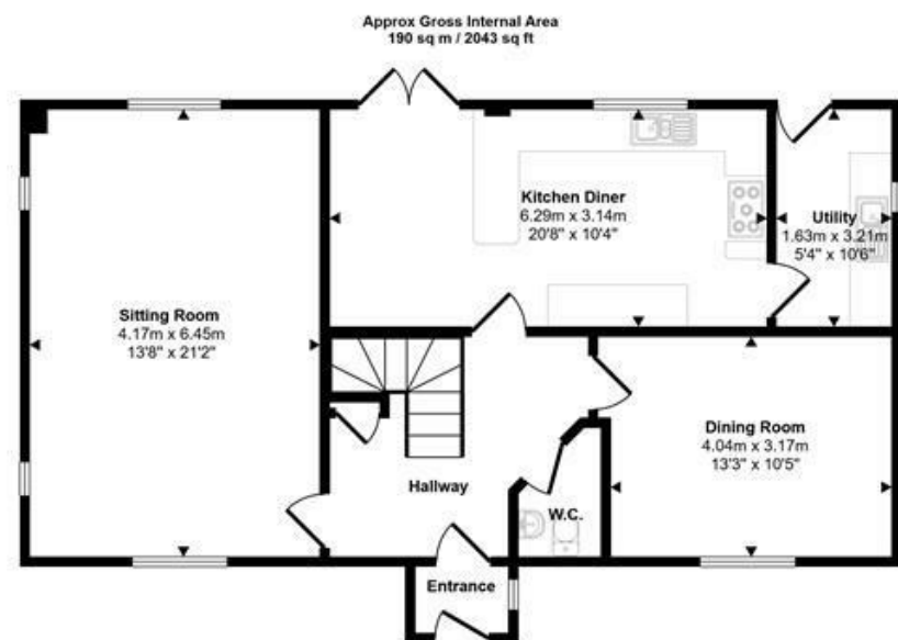
Ground Floor Approx 82 sq m / 881 sq ft