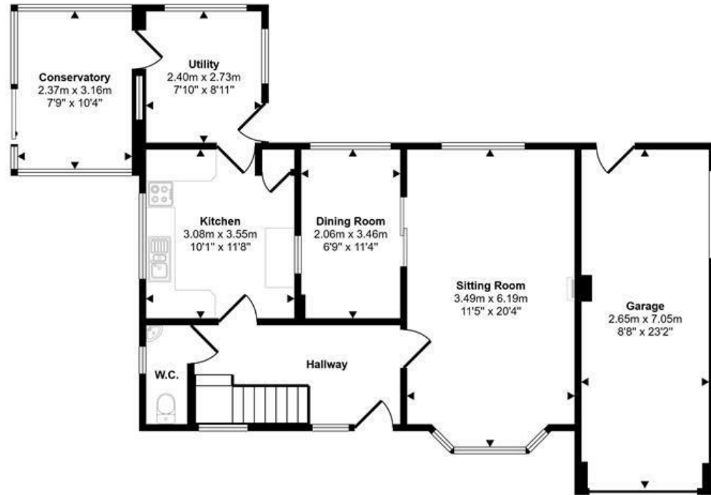
Ground Floor Approx 86 sq m / 928 sq ft

Approx Gross Internal Area 149 sq m / 1602 sq ft