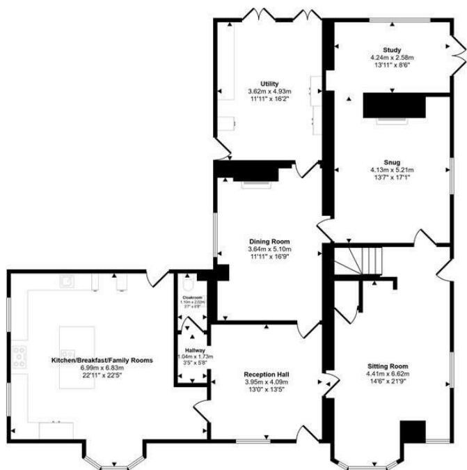
Ground Floor Approx 171 sq m / 1839 sq ft

Approx Gross Internal Area 386 sq m / 4176 sq ft