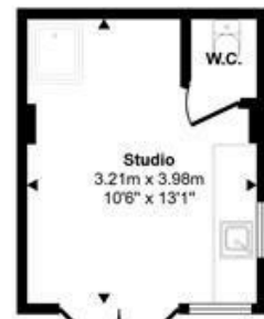
Outbuilding Approx 13 sq m / 136 sq ft

This floorplan is only for illustrative purposes and is not to scale. Measurements of rooms, doors, windows, and any items are approximate and no responsibility is taken for any error, omission or mis-statement. Icons of items such as bathroom suites are representations only and may not look like the real items. Made with Made Snappy 360.