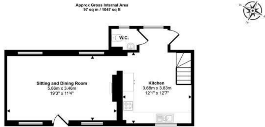
Ground Floor Approx 42 sq m / 451 sq ft