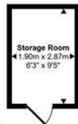
Storage Room Approx 5 sq m / 59 sq ft