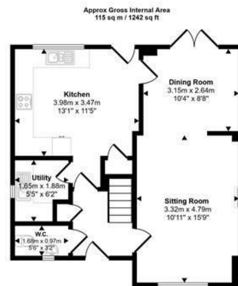
Ground Floor Approx 51 sq m / 552 sq ft