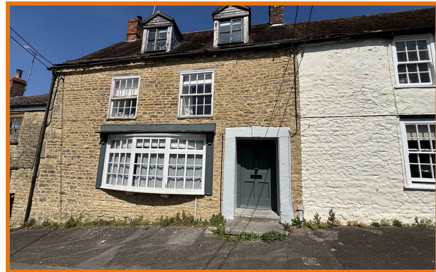
Mill Street Wincanton