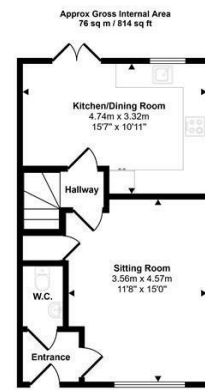
Ground Floor Approx 38 sq m / 409 sq ft