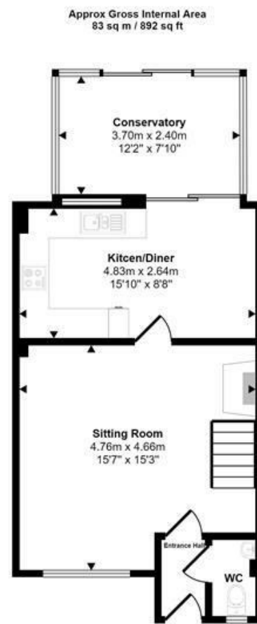
Ground Floor Approx 48 sq m / 513 sq ft