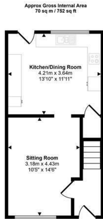
Ground Floor Approx 35 sq m / 372 sq ft