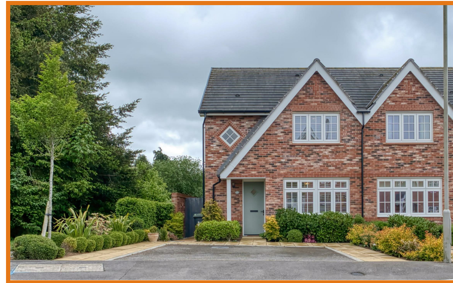
Vale View Shaftesbury