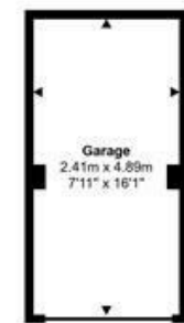
Garage Approx 12 sq m / 127 sq ft

This floorplan is only for illustrative purposes and is not to scale. Measurements of rooms, doors, windows, and any items are approximate and no responsibility is taken for any error, omission or mis-statement. Icons of items such as bathroom suites are representations only and may not look like the real items. Made with Made Snappy 360.