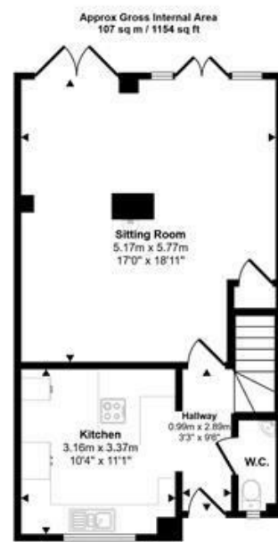
Ground Floor Approx 47 sq m / 511 sq ft