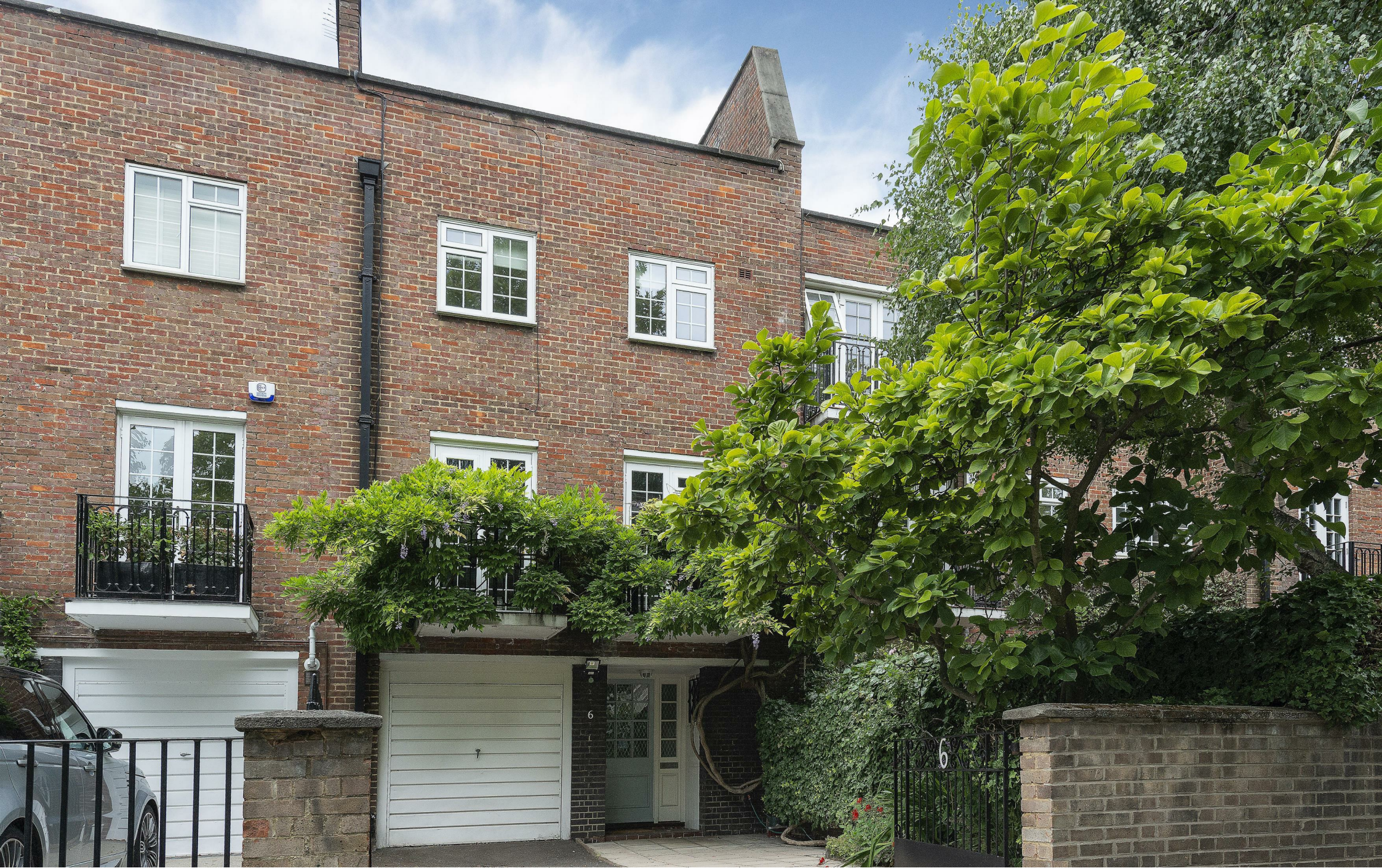
6 Blomfield Road, Little Venice London W9 1AH Asking price £2,999,999 Freehold