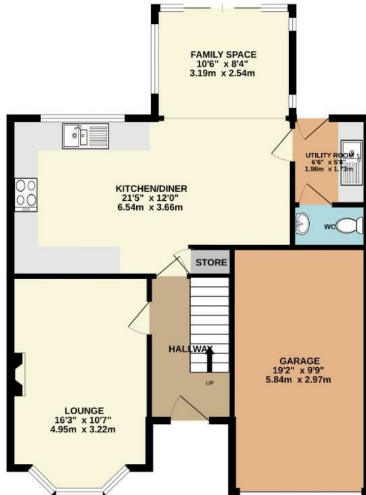
GROUND FLOOR 813 sq.ft. (75.5 sq.m.) approx.