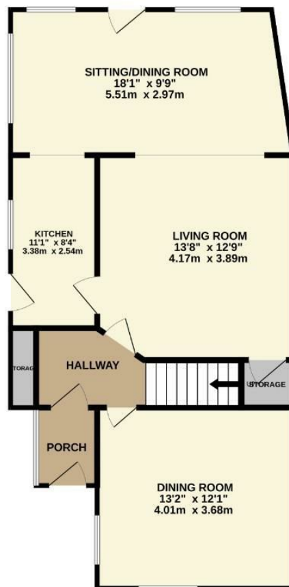
GROUND FLOOR 678 sq.ft. (63.0 sq.m.) approx.