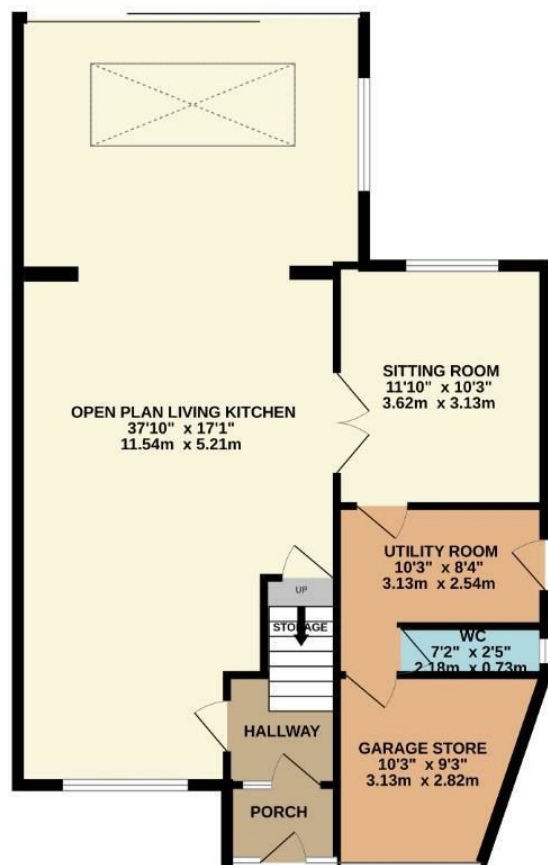
GROUND FLOOR 918 sq.ft. (85.3 sq.m.) approx.