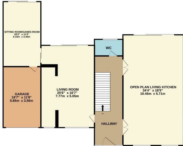
GROUND FLOOR 1800 sq.ft. (167.2 sq.m.) approx.