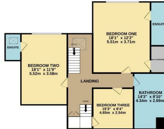
1ST FLOOR 1008 sq.ft. (93.6 sq.m.) approx.