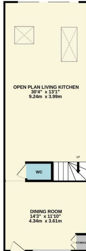
GROUND FLOOR 599 sq.ft. (55.6 sq.m.) approx.