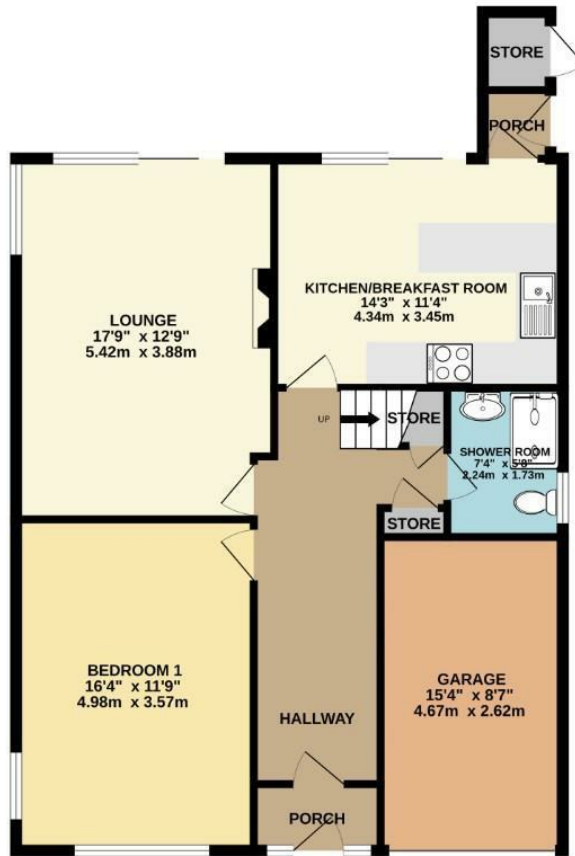
GROUND FLOOR 941 sq.ft. (87.4 sq.m.) approx.