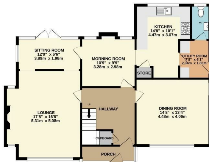
GROUND FLOOR 1001 sq.ft. (93.0 sq.m.) approx.