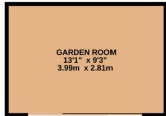
GARDEN ROOM 121 sq.ft. (11.2 sq.m.) approx.