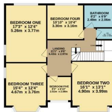
1ST FLOOR 1004 sq.ft. (93.3 sq.m.) approx.