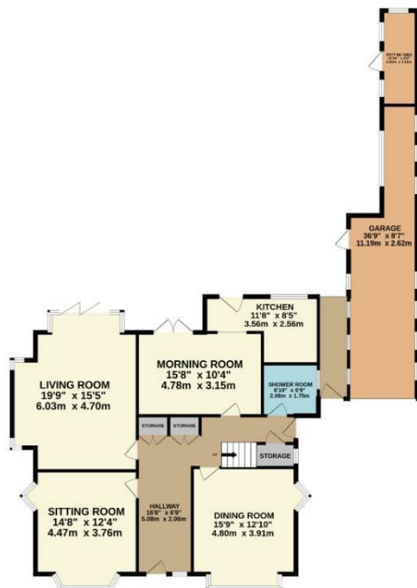
GROUND FLOOR 1527 sq.ft. (141.9 sq.m.) approx.