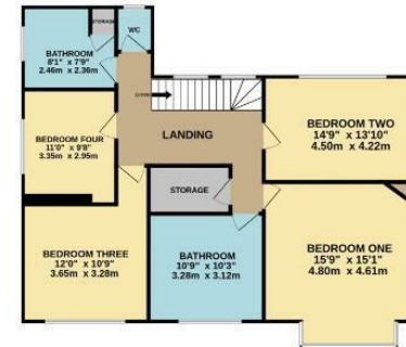
1ST FLOOR 985 sq.ft. (91.5 sq.m.) approx.