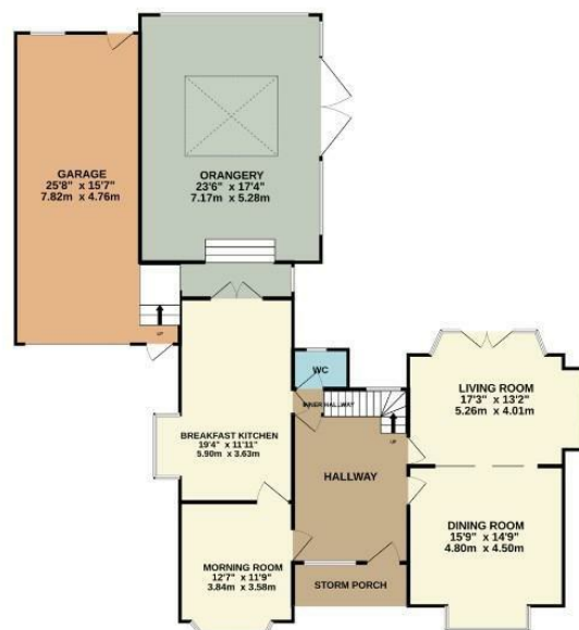
GROUND FLOOR 1827 sq.ft. (169.7 sq.m.) approx.