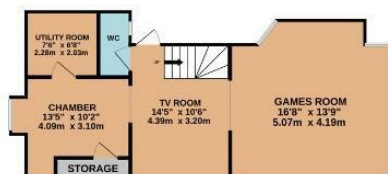
BASEMENT 987 sq.ft. (94.6 sq.m.) approx.