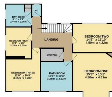
1ST FLOOR 985 sq.ft. (91.5 sq.m.) approx.