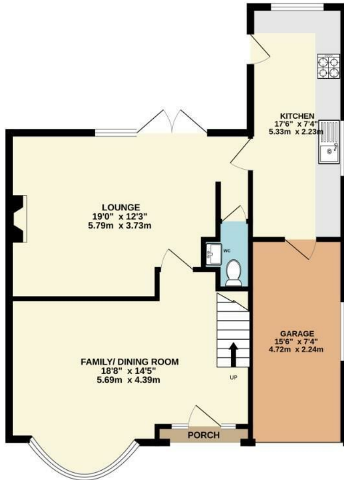
GROUND FLOOR 723 sq.ft. (67.1 sq.m.) approx.