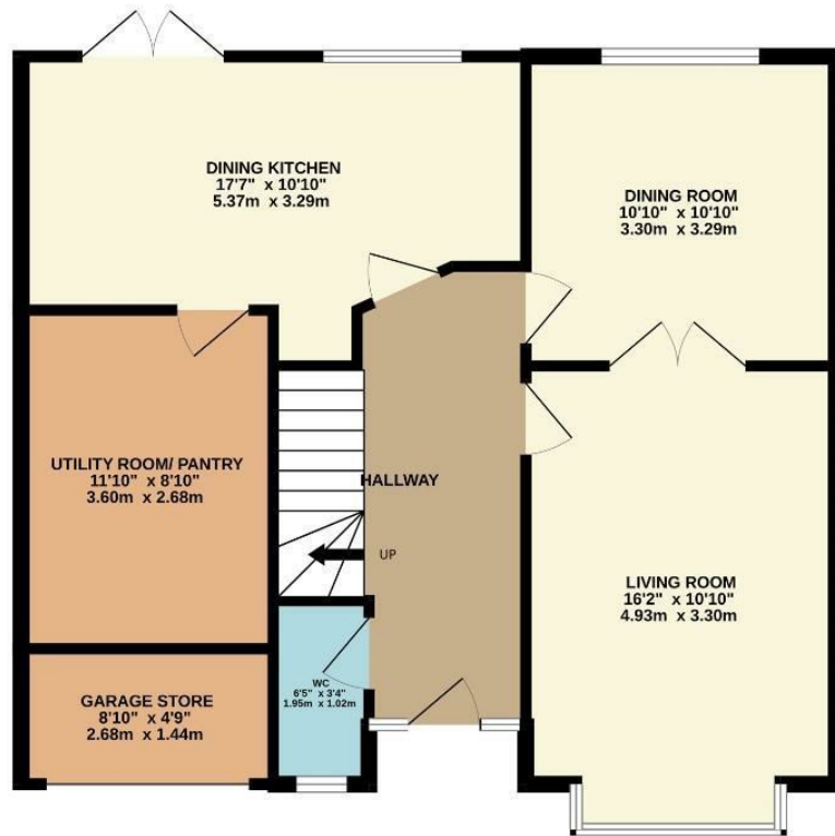
GROUND FLOOR 722 sq.ft. (67.1 sq.m.) approx.