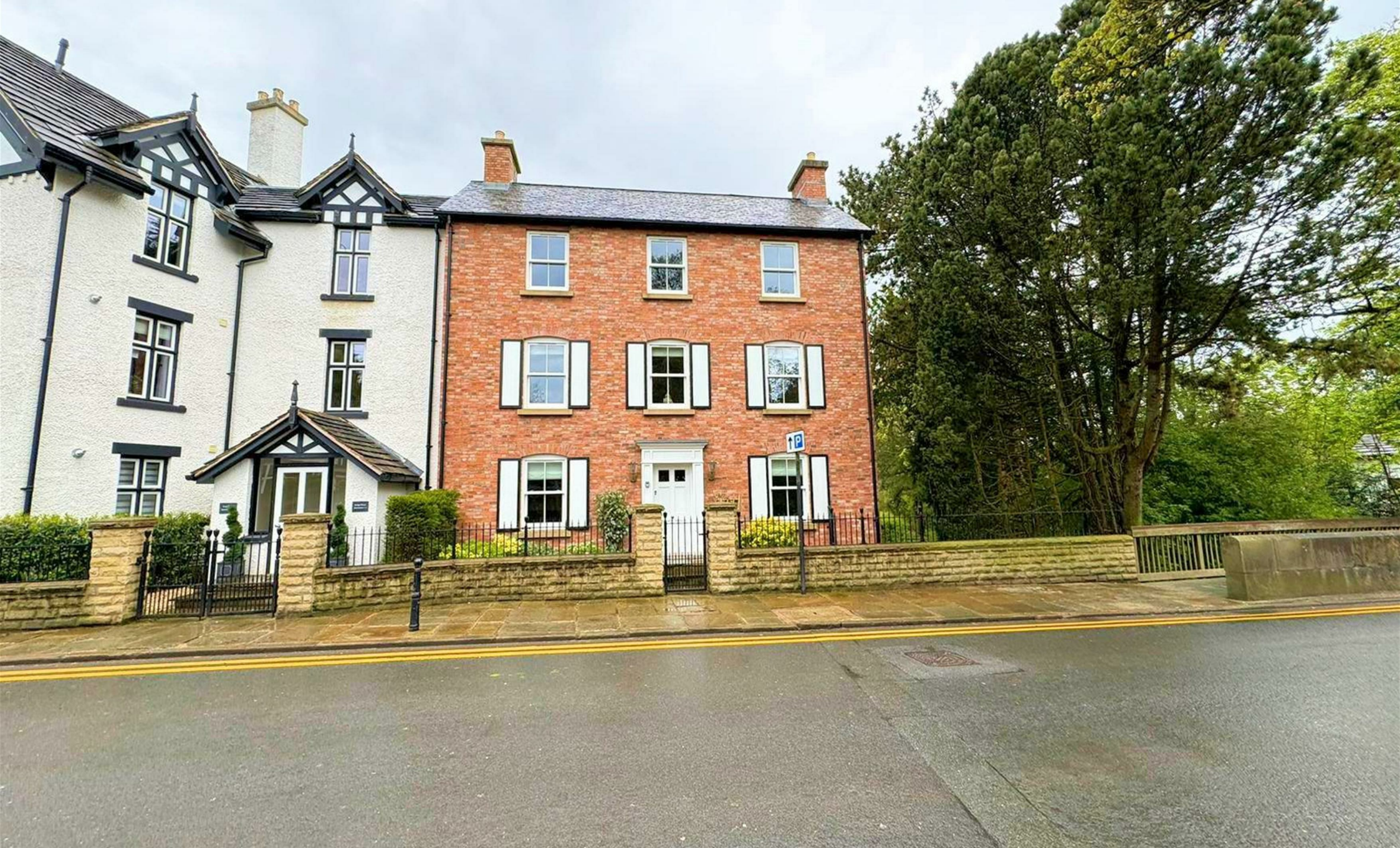
The Ash, Apartment 1, Bridge House The Village, Prestbury, SK10 4DG