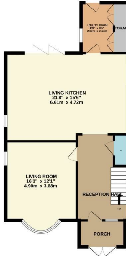
GROUND FLOOR 757 sq.ft. (70.3 sq.m.) approx.