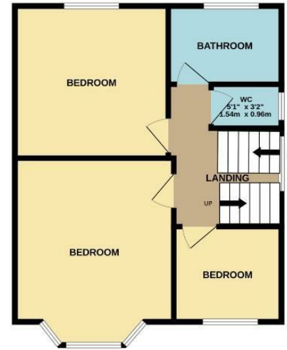
1ST FLOOR 446 sq.ft. (41.4 sq.m.) approx.