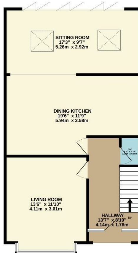
GROUND FLOOR 668 sq.ft. (62.1 sq.m.) approx.