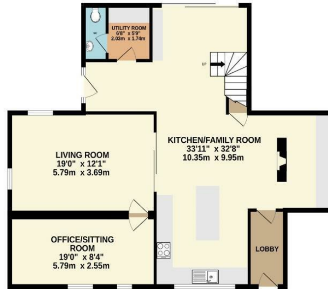
GROUND FLOOR 1104 sq ft. (102.3 sq.m.) approx.