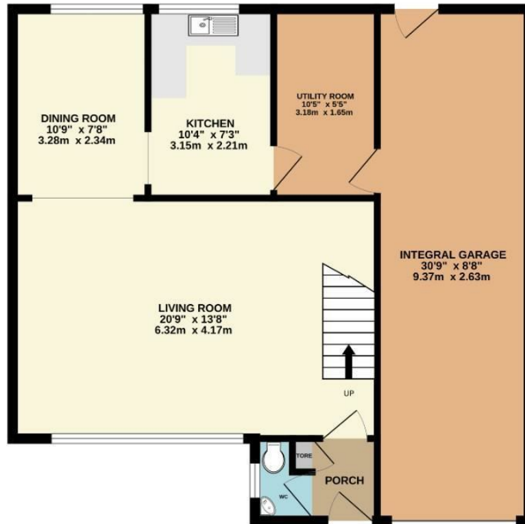
GROUND FLOOR 789 sq.ft. (73.3 sq.m.) approx.