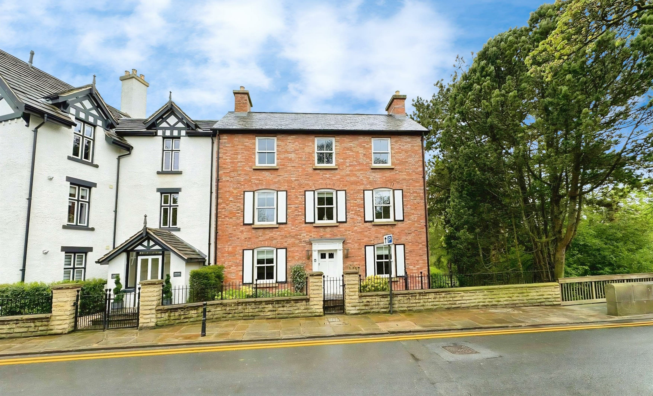
The Ash, Apartment 1, Bridge House The Village, Prestbury, SK10 4DG