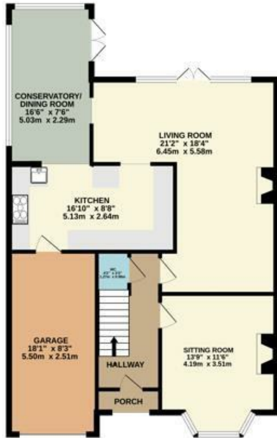
GROUND FLOOR 948 sq.ft. (88.1 sq.m.) approx.