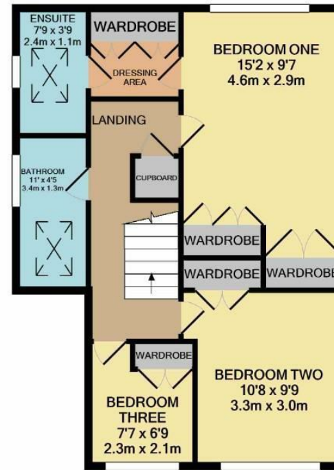
1ST FLOOR APPROX. FLOOR AREA 510 SQ.FT. (47.4 SQ.M.)

TOTAL APPROX. FLOOR AREA 1193 SQ.FT. (110.8 SQ.M.)