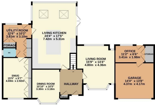
FIRST FLOOR 1042 sq.ft. (96.8 sq.m.) approx.