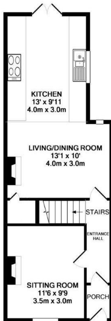
GROUND FLOOR APPROX. FLOOR AREA 434 SQ.FT. (40.3 SQ.M.)