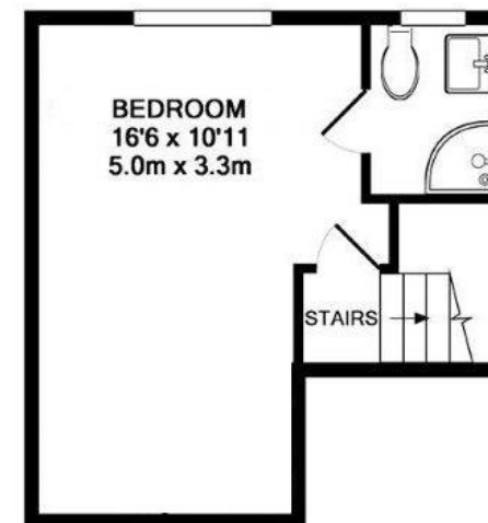
2ND FLOOR APPROX. FLOOR AREA 224 SQ.FT. (20.8 SQ.M.)

TOTAL APPROX. FLOOR AREA 1084 SQ.FT. (100.7 SQ.M.) Measurements are approximate. Not to scale. Illustrative purposes only