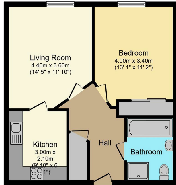
Floor Plan Floor area 53.0 sq. m. (570 sq. ft.) approx

Total floor area 53.0 sq. m. (570 sq. ft.) approx This Floor Plan is for illustration purposes only and may not be representative of the property. The position and size of doors, windows and other features are approximate. Unauthorized reproduction prohibited. © KeyAGENT