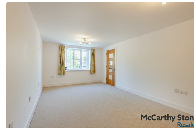
McCarthy Stone Resales