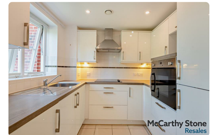
McCarthy Stone Resales