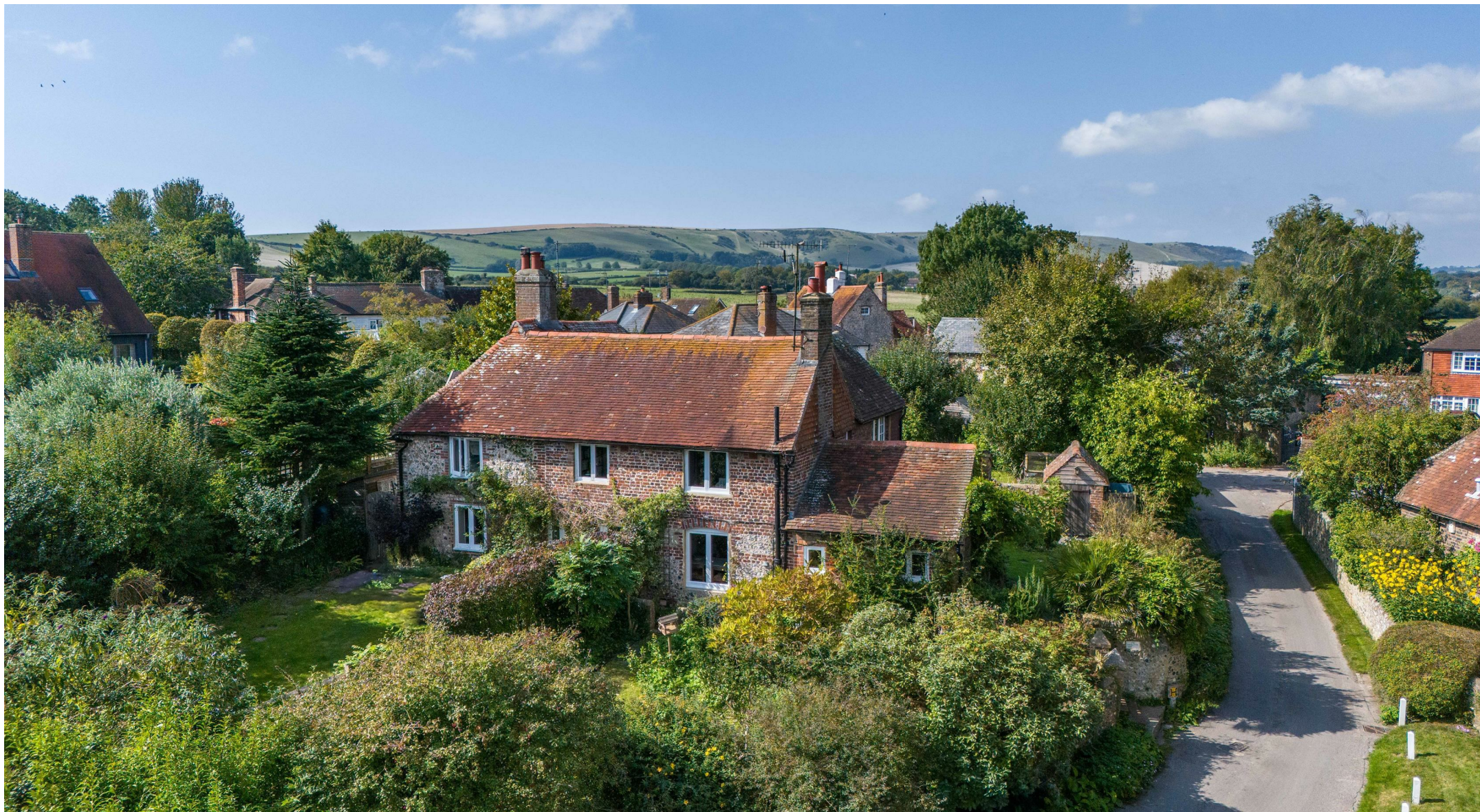
The Street, Rodmell