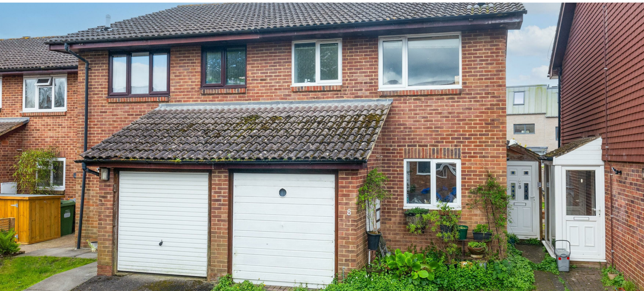
De Grey Close, Lewes