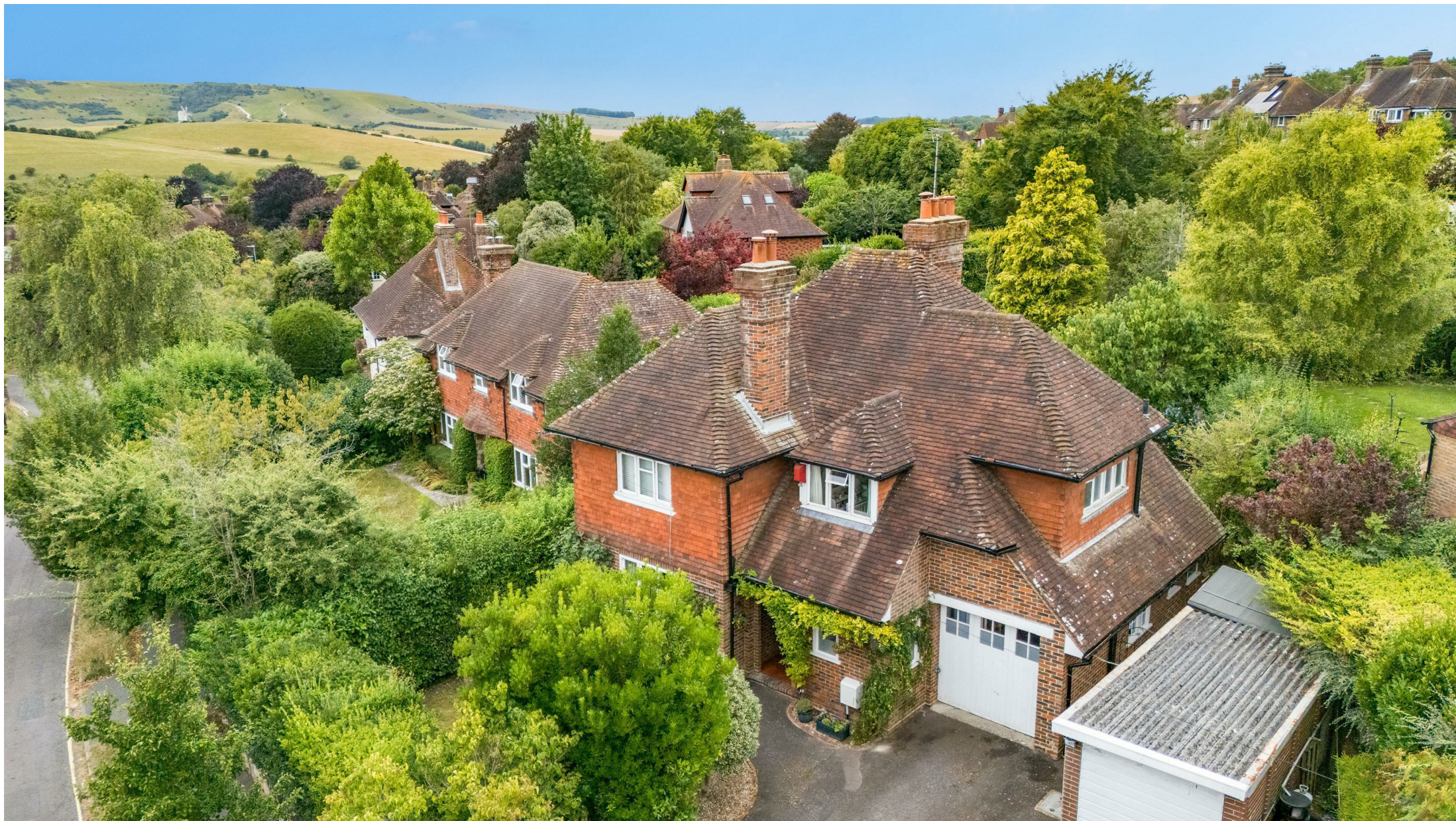
Houndean Rise, Lewes