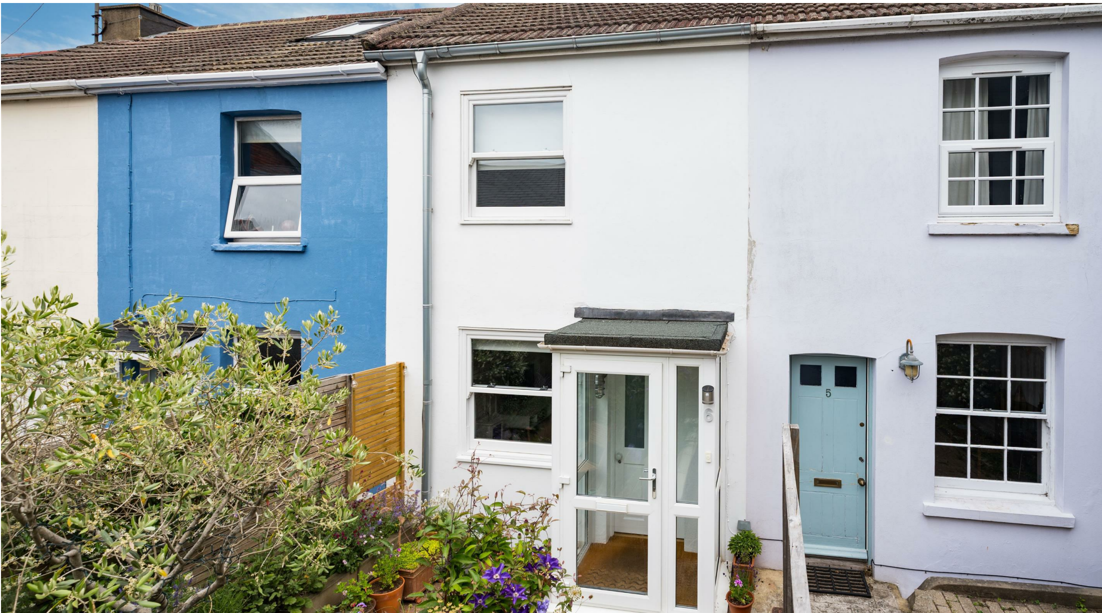
Southdown Place, Lewes