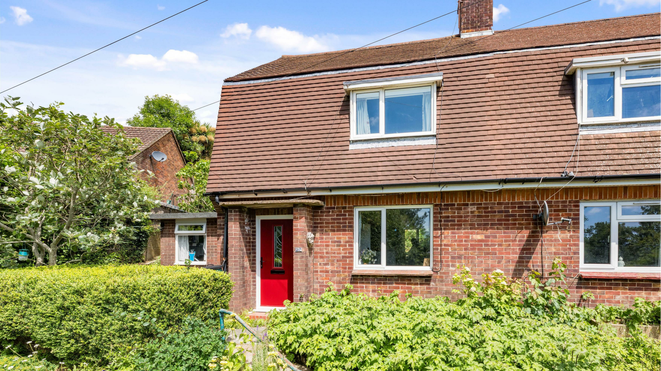
The Lynchets, Lewes