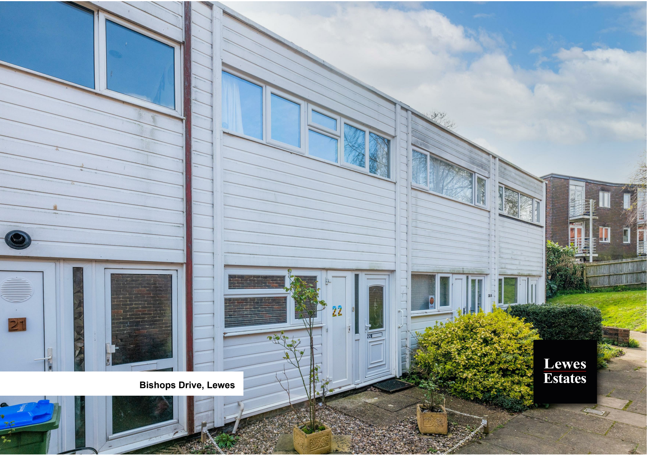
Bishops Drive, Lewes