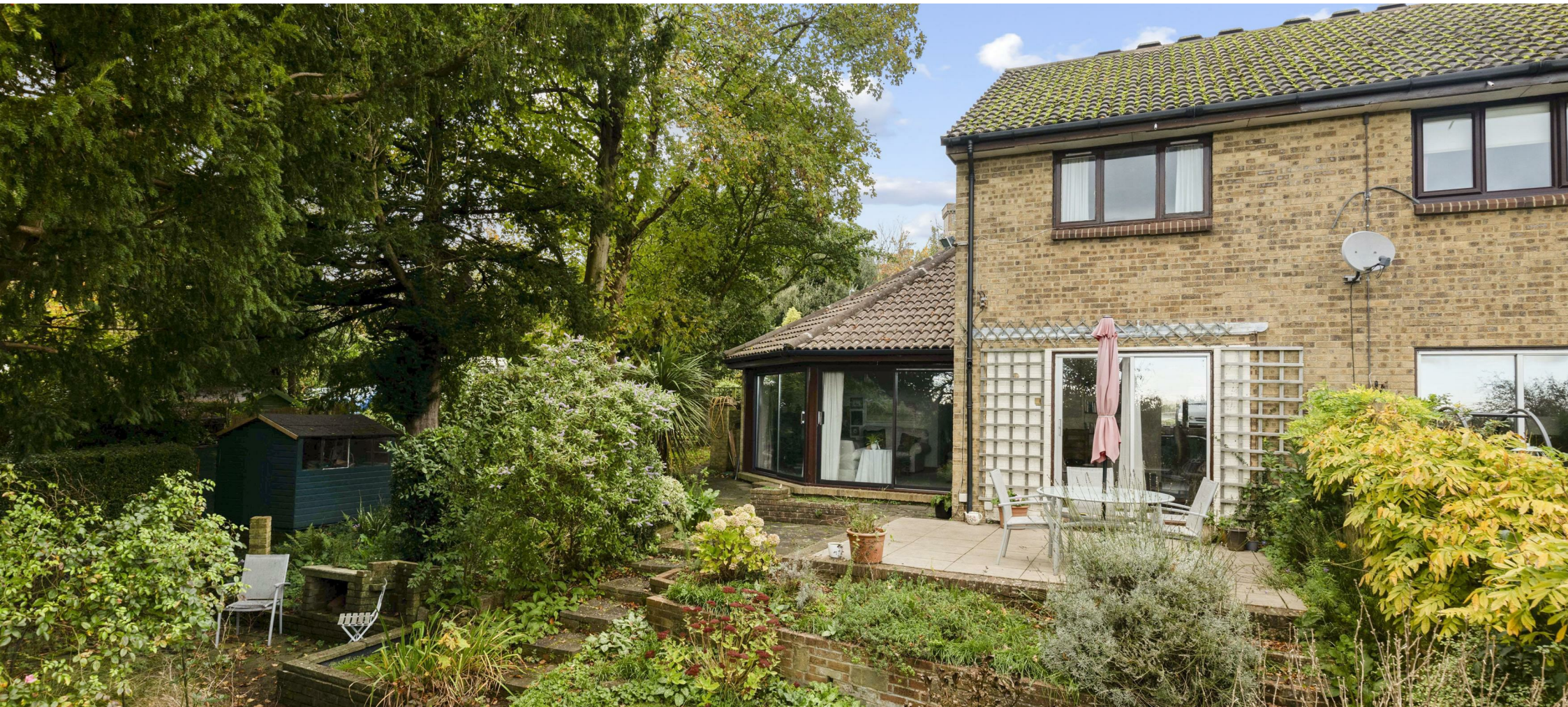
Warren Drive, LEWES