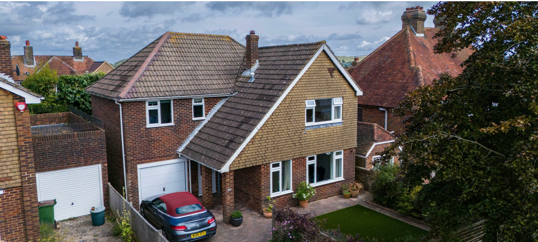
Ferrers Road, Lewes