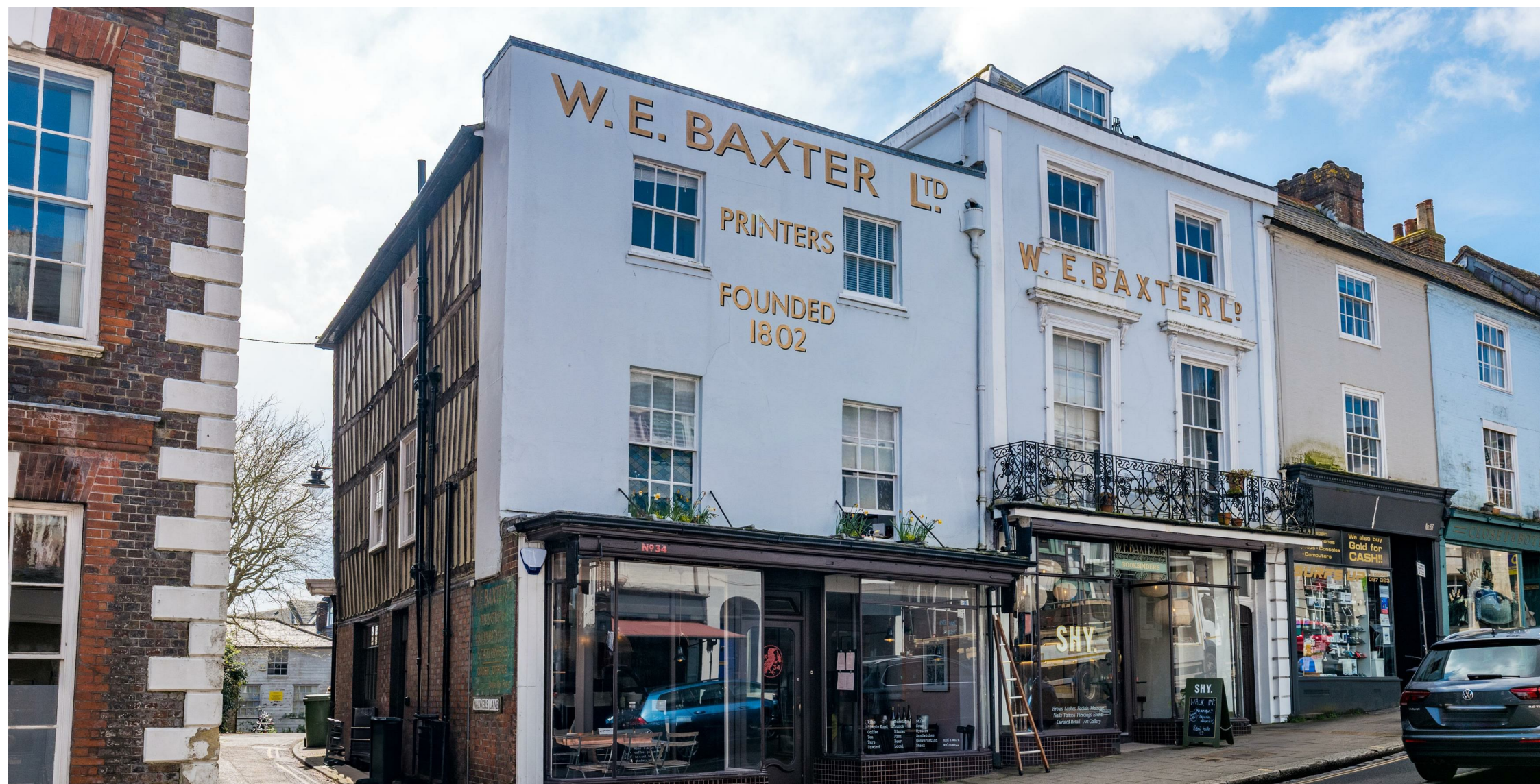
High Street, Lewes